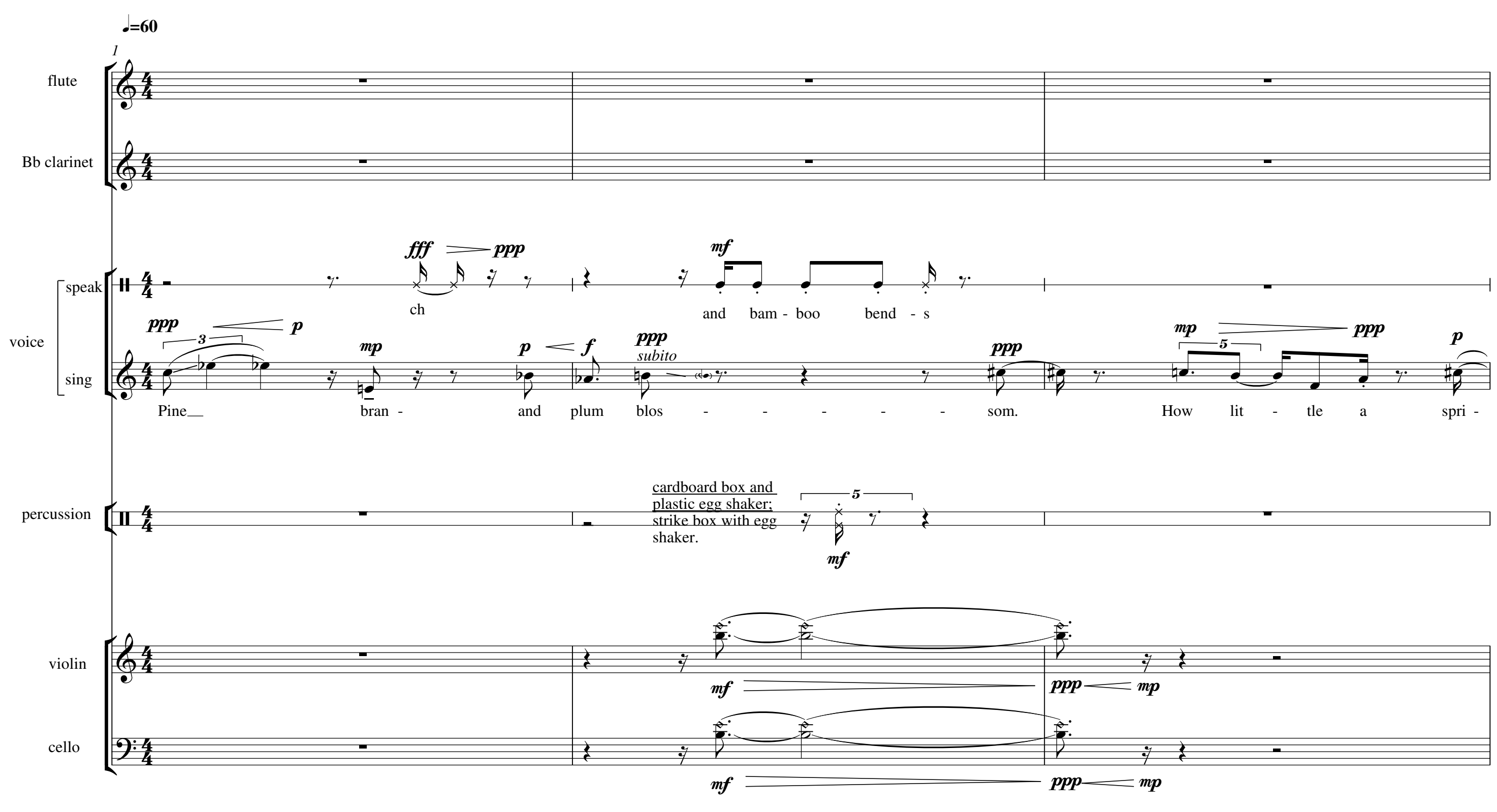
No. 3 Pine branch and